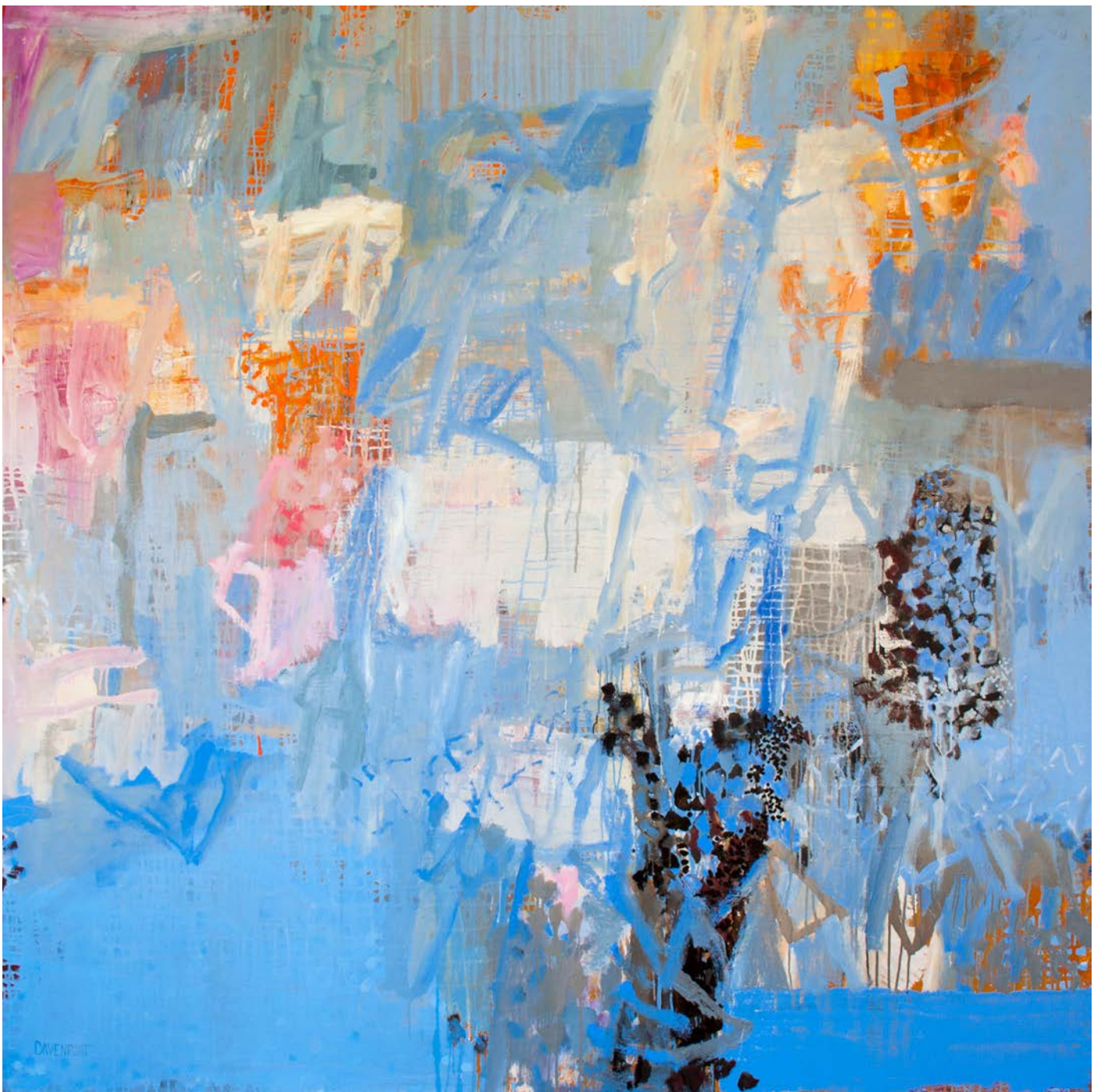
The wetlands oil on Belgian linen 200 x 200 cm $15.000