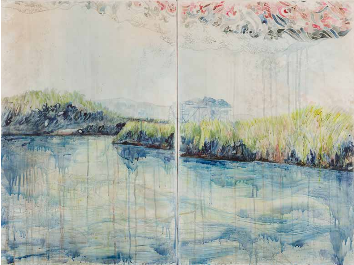
Belinda Fox, Watching the Sky , watercolour drawing on board, 92 x 121 cm, $8,900 - SOLD