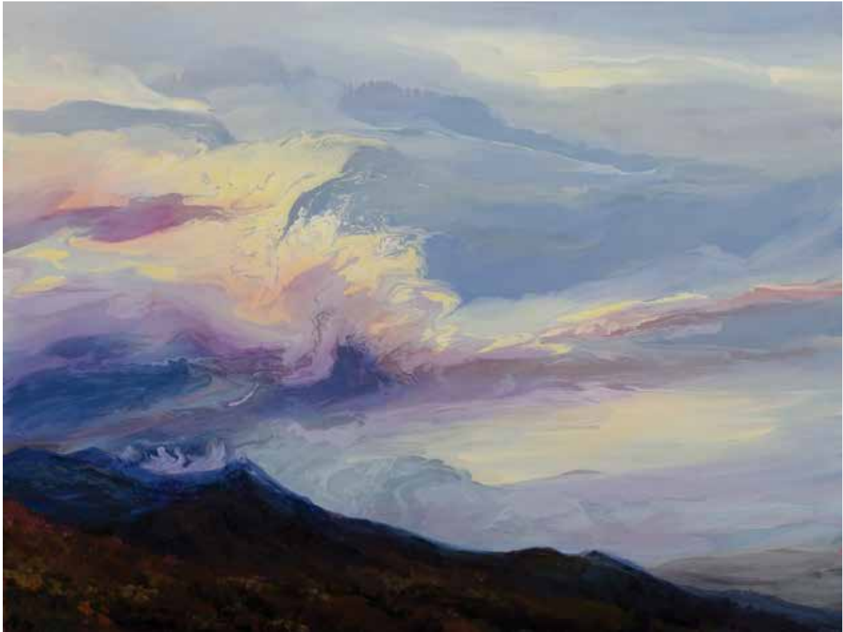
Carla Hananiah, Journey to the Heights , oil on board, 90 x 120 cm, $4,800