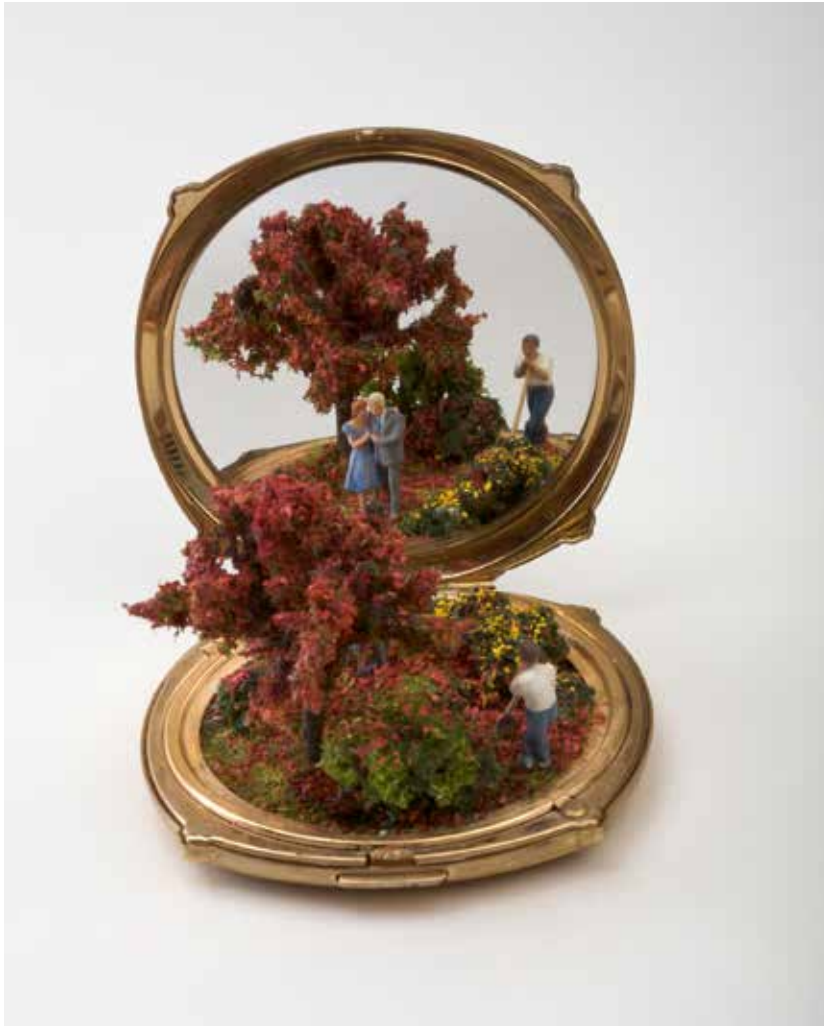
Kendal Murray, Long to Belong , mixed media assemblage, 8 x 7.5 x 9 cm, $1,400