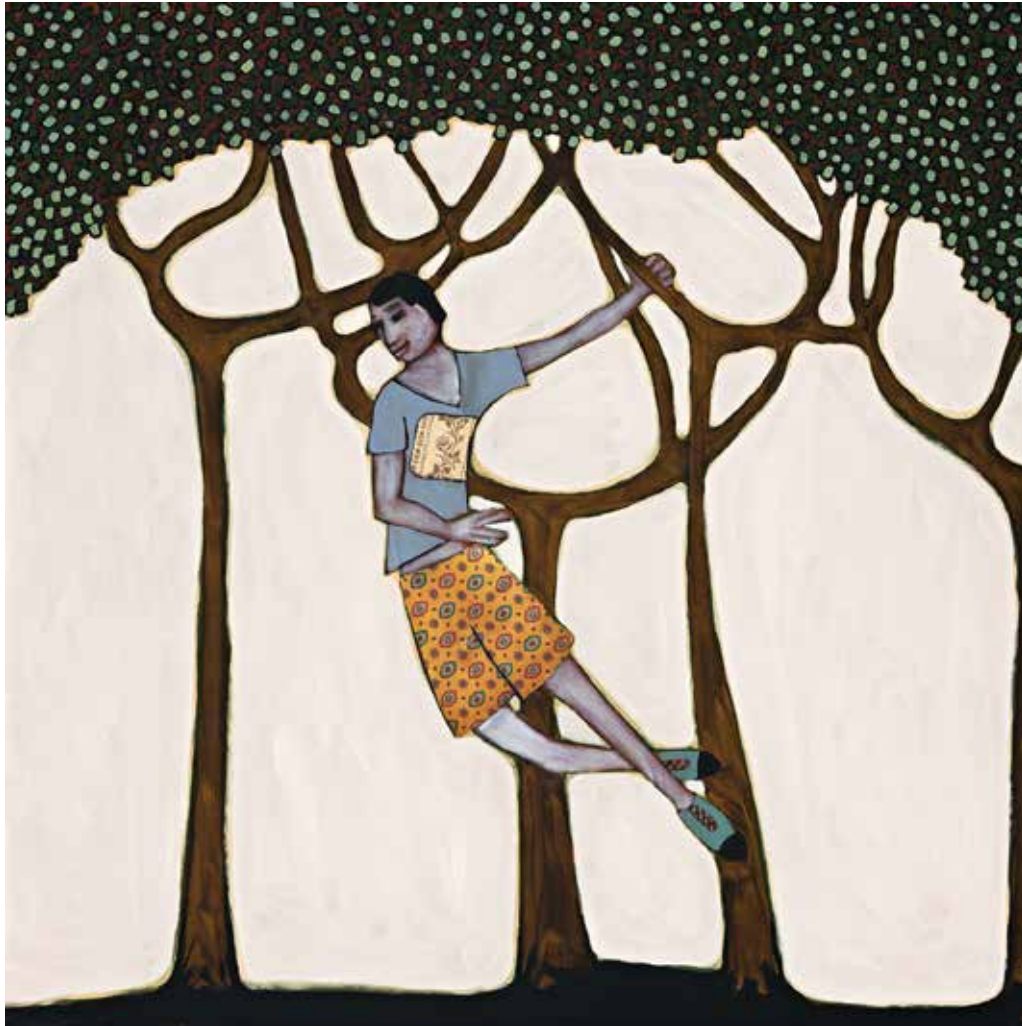
John Baird, Dismount , acrylic, wallpaper, fabric & shellac on board, 120 x 120 cm, $6,200