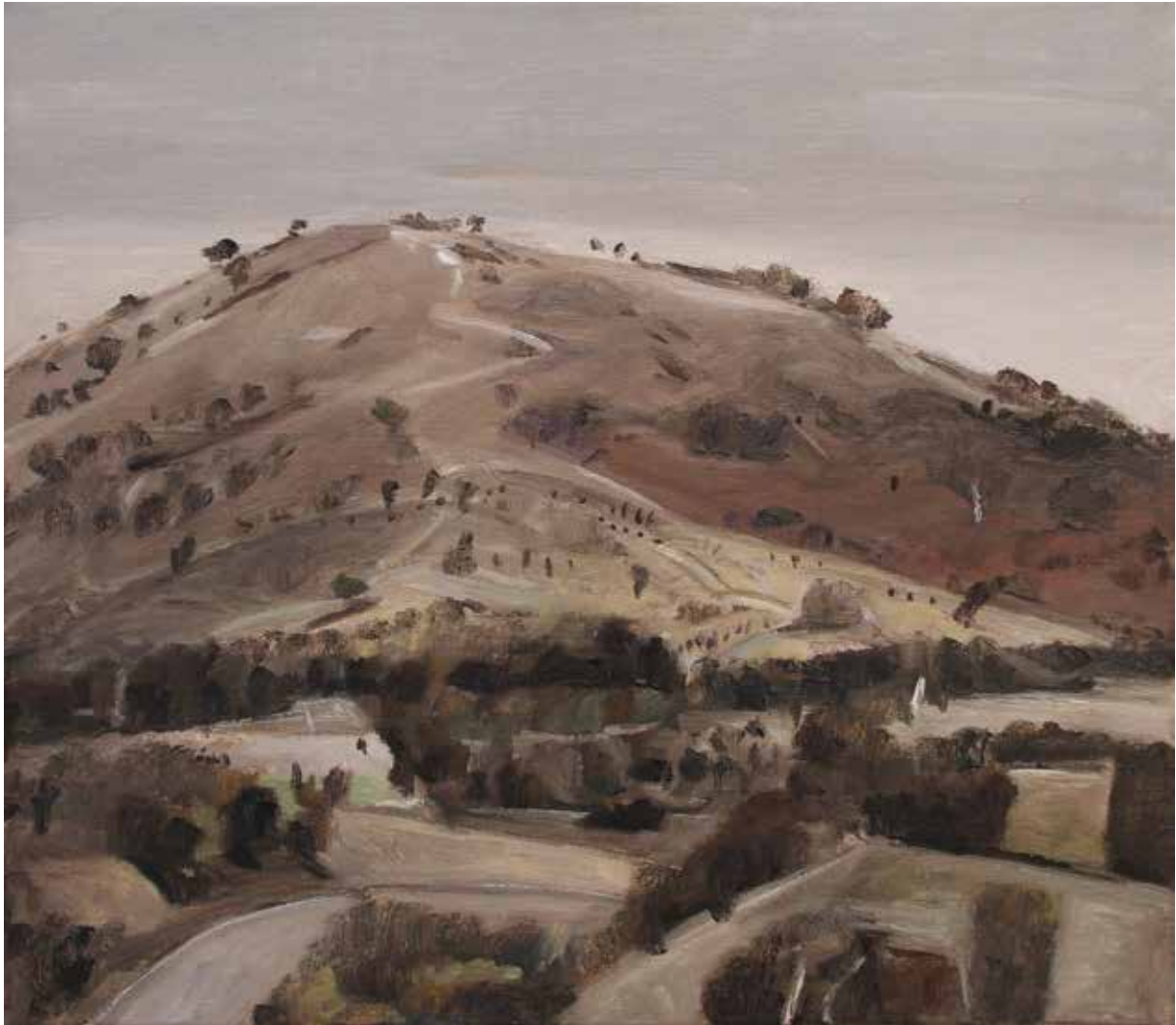
Peter Simpson, Untitled , oil on linen, 41 x 46 cm, $2,600