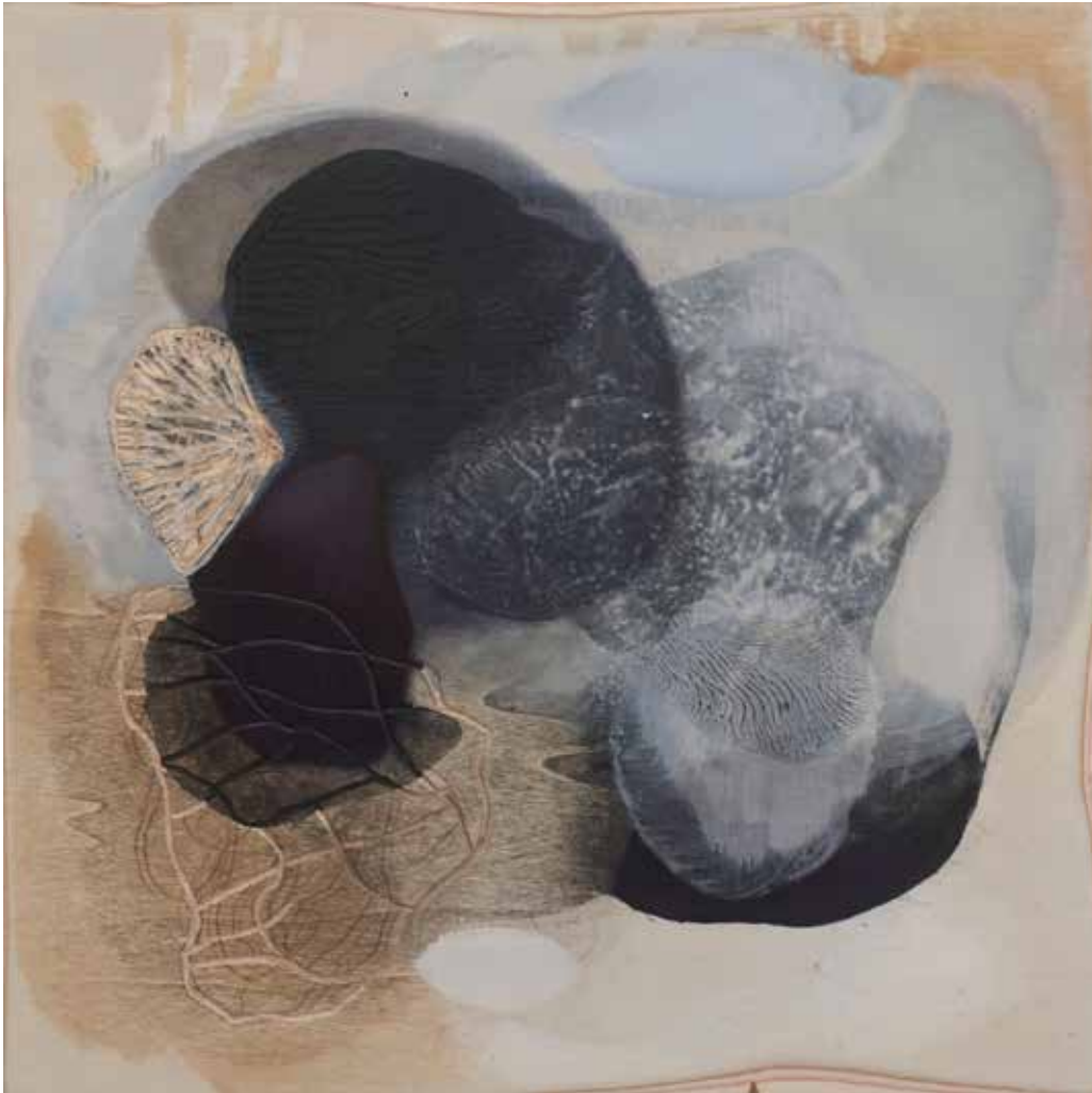
Emma Walker, Qualia II , oil and acrylic on board, 50 x 50 cm, $2,000