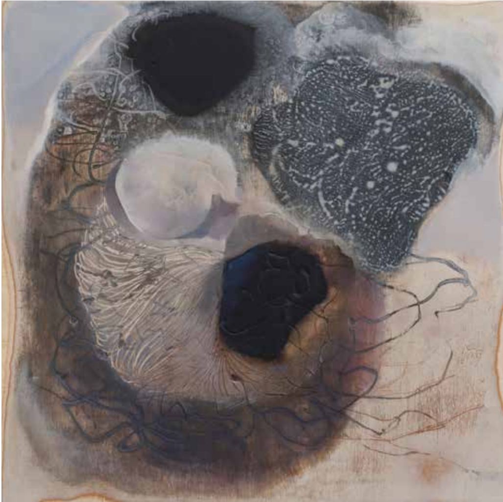
Emma Walker, Qualia III , oil and acrylic on board, 50 x 50 cm, $2,000