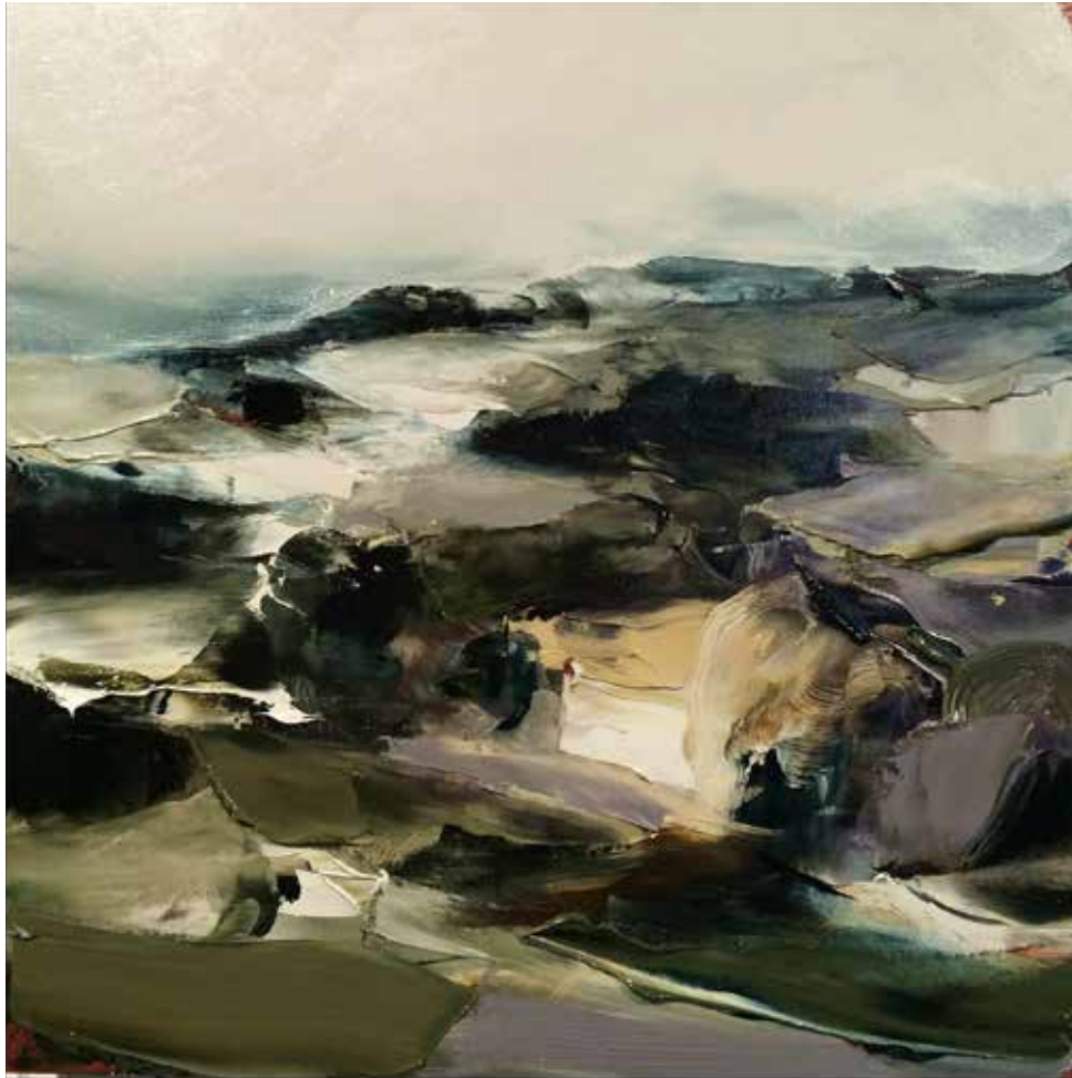
Aaron Kinnane, In before the rain , oil on canvas, 54 x 54 cm, $3,200