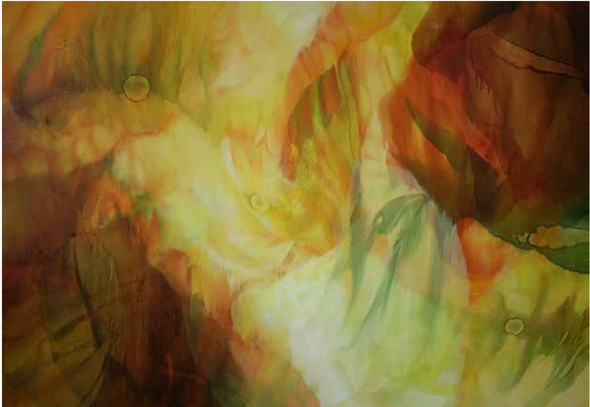
Ian Greig, More than This , oil on canvas, 137 x 198 cm, $9,900