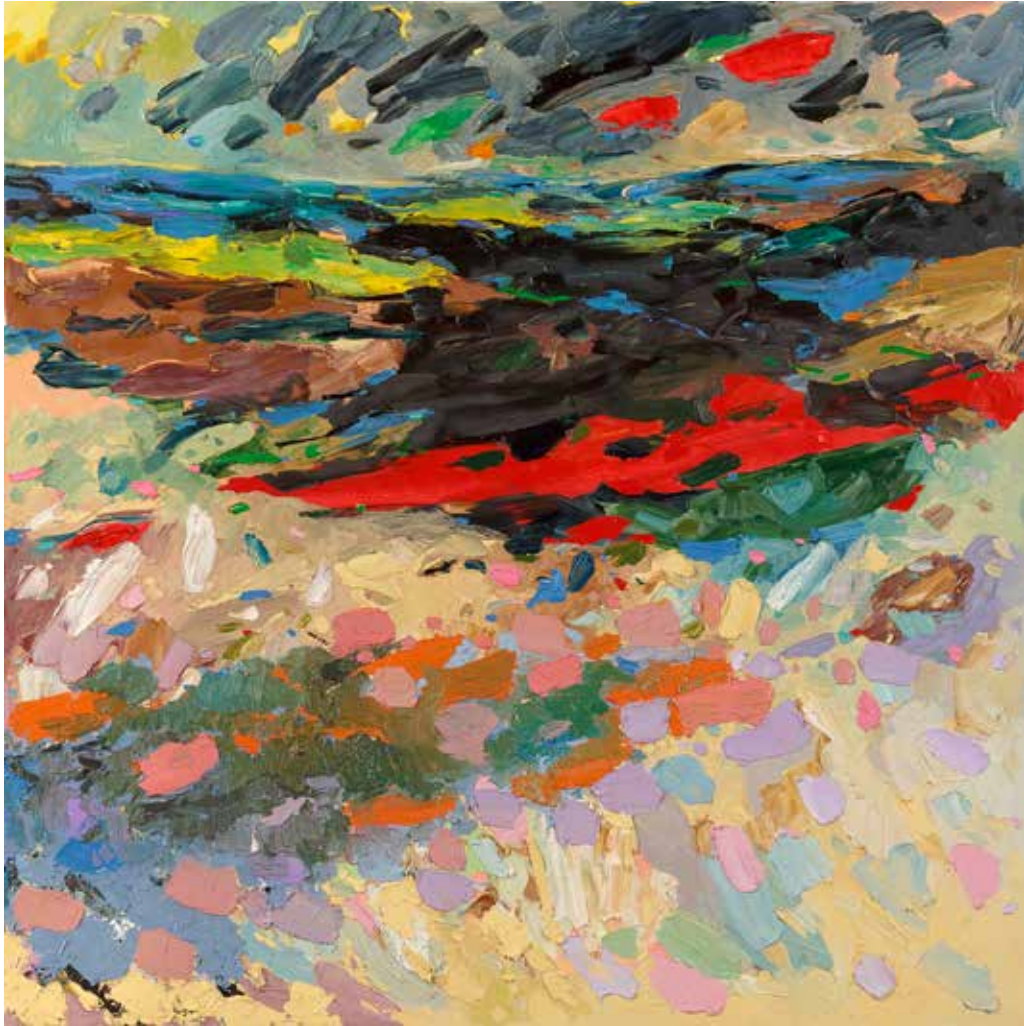
Colin Pennock, Strata , oil on linen, 140 x 140 cm, $14,500