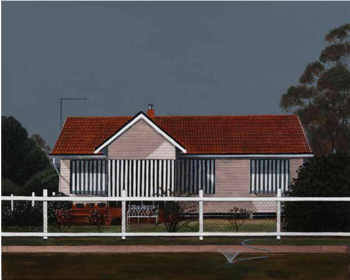
Robyn Sweaney, Summer – waiting for rain , acrylic on linen, 40 x 50 cm, $3,200