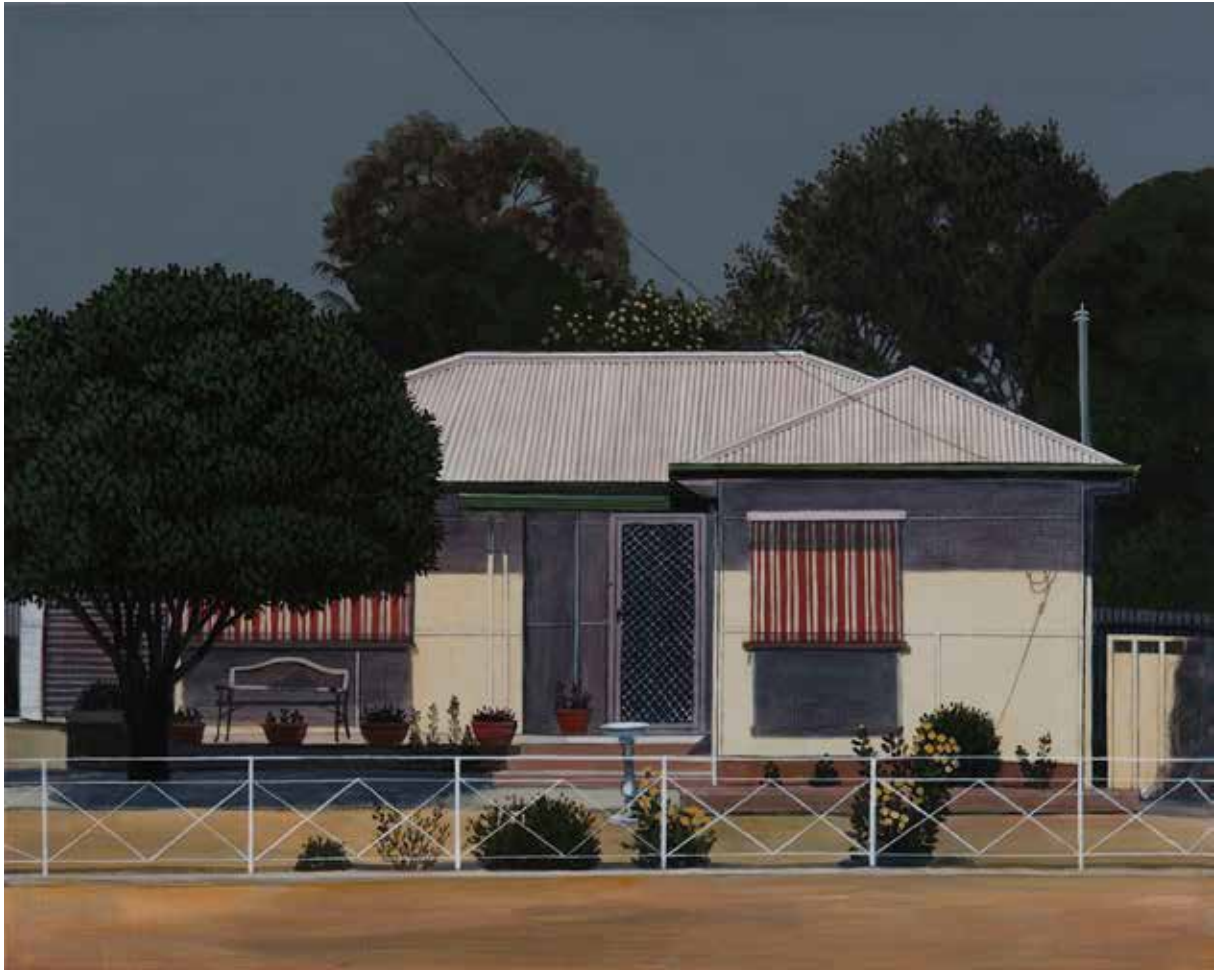
Robyn Sweaney, Looking for shade , acrylic on linen, 40 x 50 cm, $3,200 - SOLD