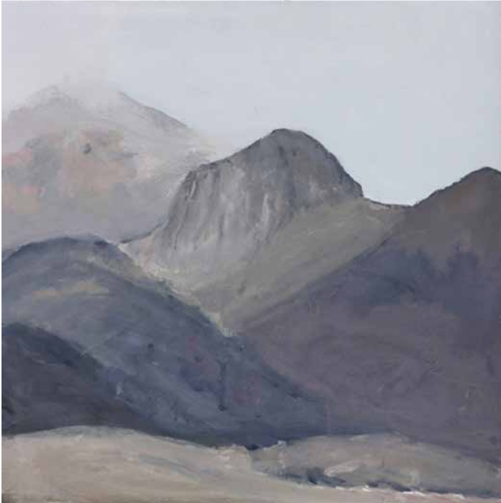
Peter Simpson, Mt Ruapehu Study IV , gouache on paper, 39 x 39 cm, $1,850