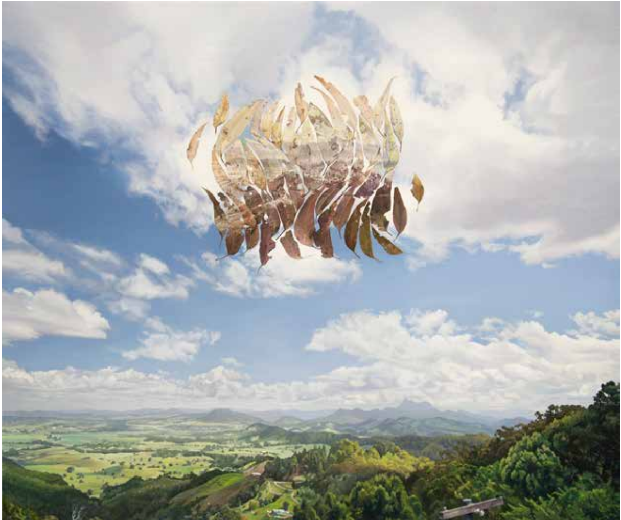
Hobie Porter, Hurley's Pass , oil on linen, 105 x 125 cm, $12,500