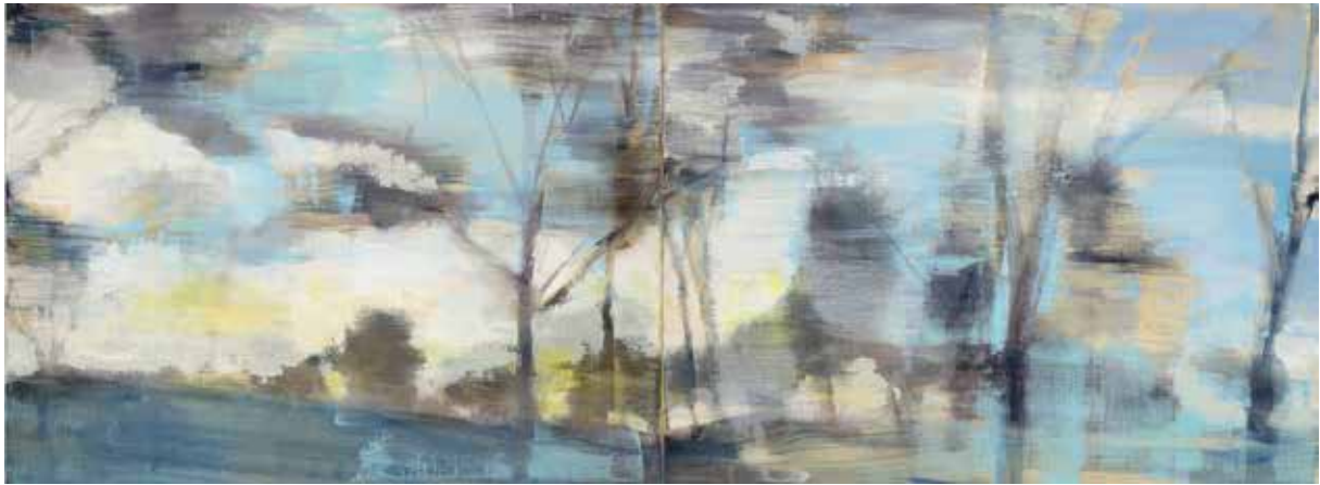
Susan Baird, Landscape and Light , oil on linen, 101.5 x 275 cm, $12,500 - SOLD