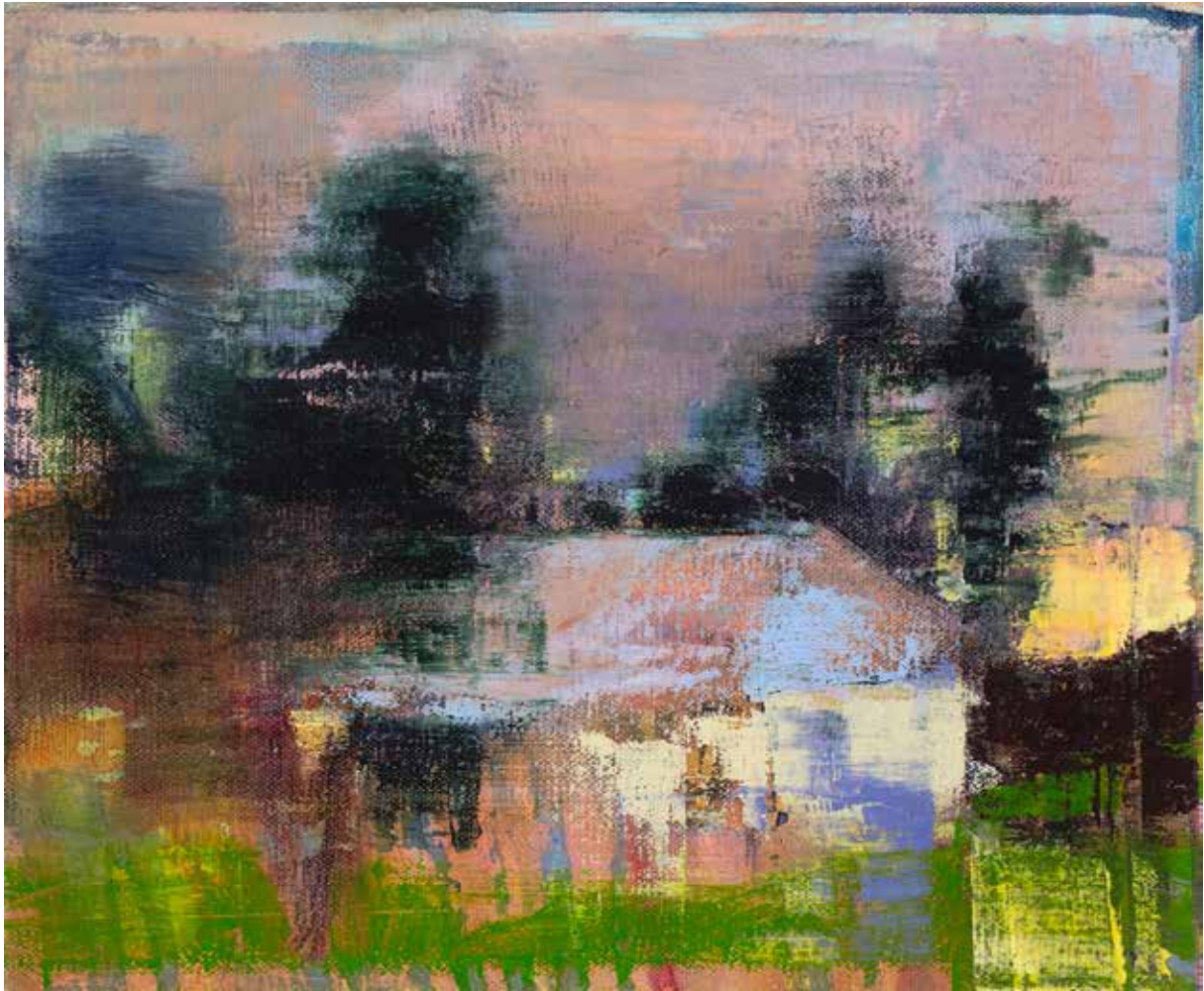
Susan Baird, Cameo , oil on linen, 25 x 30 cm, $2,000