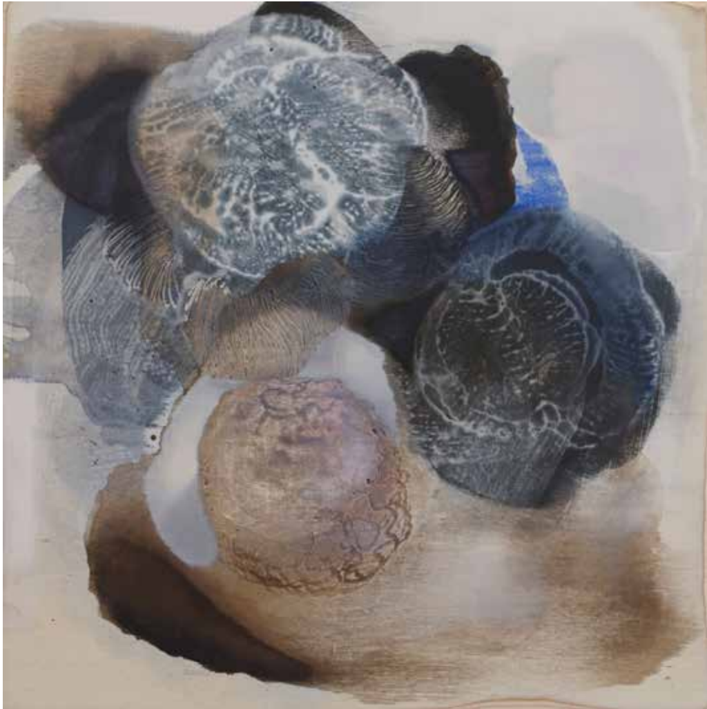
Emma Walker, Qualia , oil and acrylic on board, 50 x 50 cm, $2,000