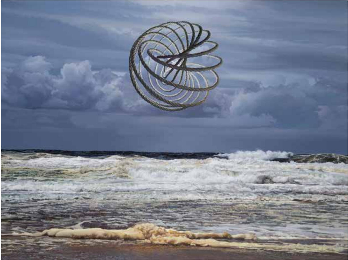
Hobie Porter, Limen , oil on polyester canvas, 68 x 90 cm, $9,900