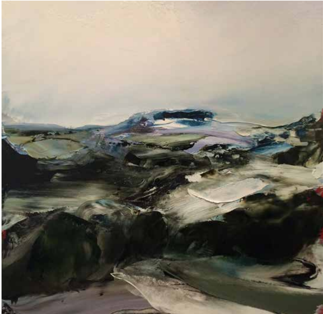
Aaron Kinnane, The Pilgrimage , oil on canvas, 54 x 54 cm, $3,200 - SOLD