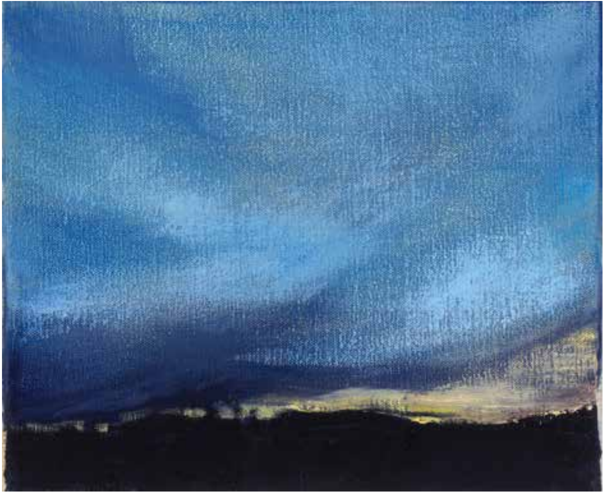
Susan Baird, Last Light, Bald Hill , oil on linen, 25 x 30 cm, $2,000