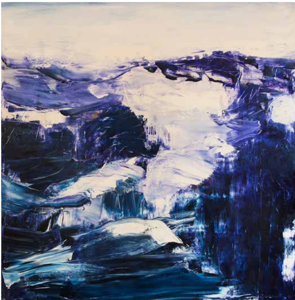
Aaron Kinnane, The Ocean Song , oil on canvas, 190 x 190 cm, $15,000 - SOLD