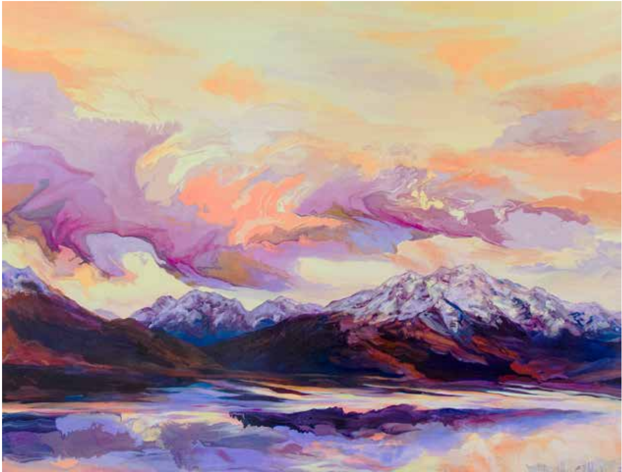
Carla Hananiah, The Royal Procession , oil on board, 91 x 122 cm, $4,500