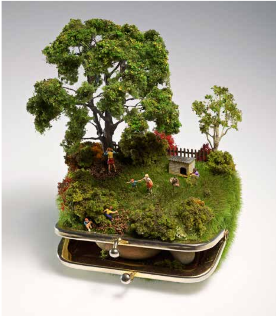
Kendal Murray, Hide and Seek, Sneak, Technique , mixed media assemblage, 16.5 x 12 x 10 cm, $3,500